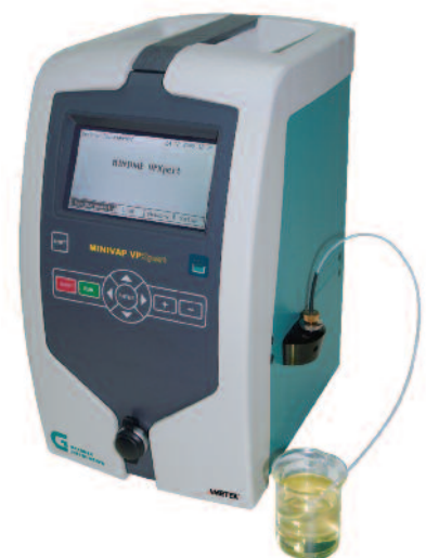
MINIVAP VPXpert – Expert vapour pressure testing at highest temperatures.

Known worldwide as "The vapour pressure specialist", GRABNER INSTRUMENTS has developed the MINIVAP VPXpert, a new extremely versatile analyser to assess temperature at different V/L ratios for ASTM D5188 tests. The MINIVAP VPXpert also is the optimum solution for testing vapour pressure of gasoline-ethanol blends at high temperatures. It allows for ramp measurements up to 120°C, providing the highest temperature range of vapour pressure testers on the market. Incorporating the world famous GRABNER vapour pressure test method, the analyser complies with all industry vapour pressure testing standards, thus enabling safe development of the new generation automotive engines for ethanol blended fuels.