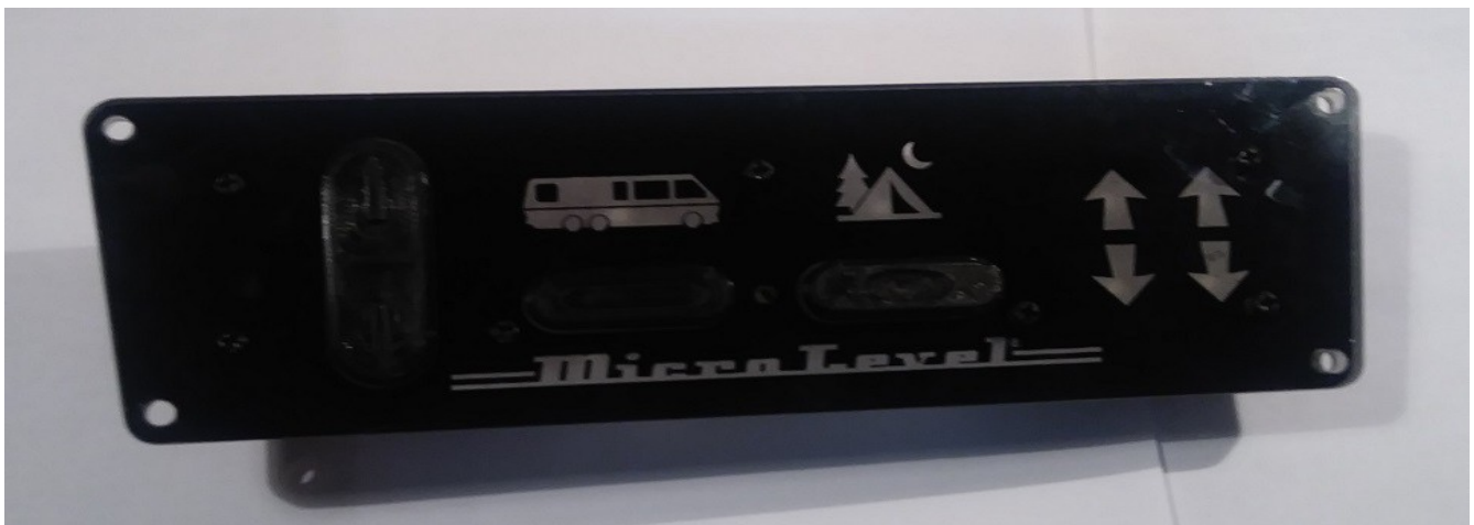
Black / Black Buttons