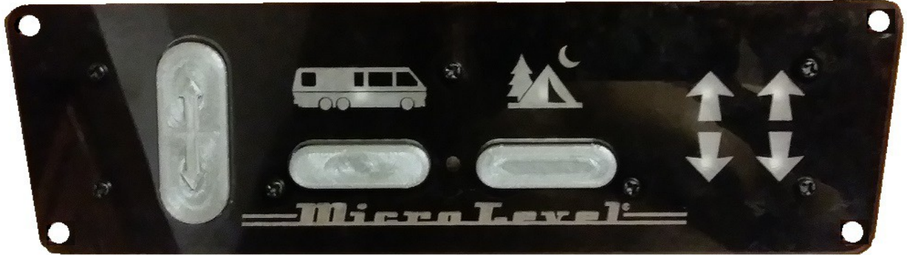
Black / Silver buttons